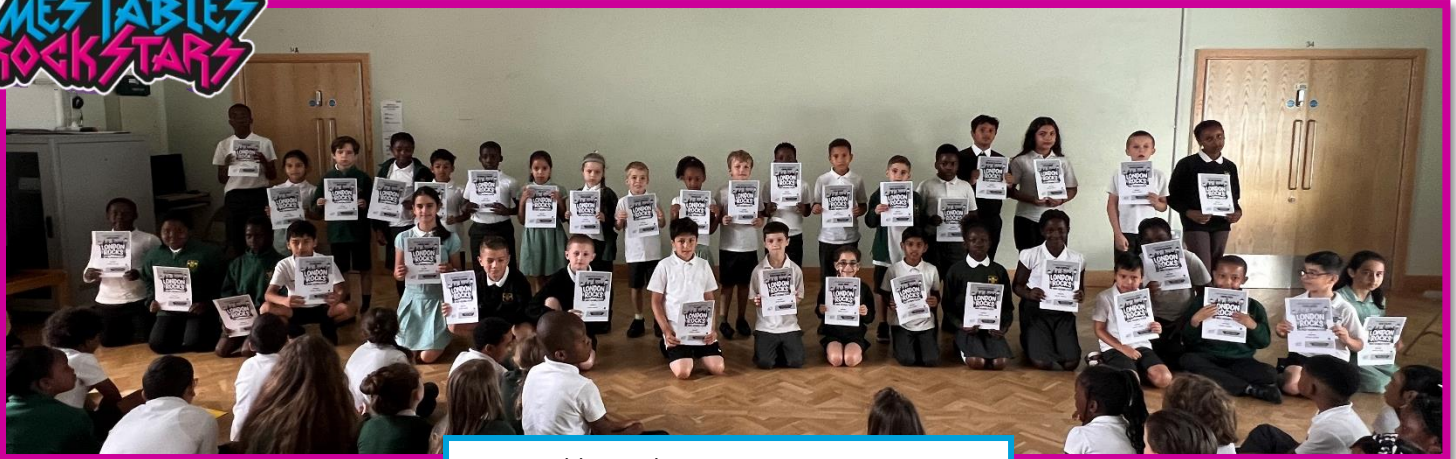
Times Tables Rocks Stars competition winners