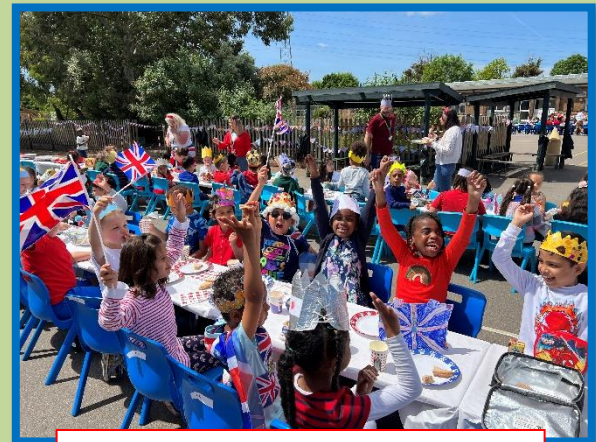
Last year's wonderful Platinum Jubilee celebration.