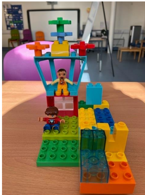
Breakfast Club Construction Team at its finest. 😊

Please join us to find out how Our Voice can support families whose children have additional needs and the different activities that ENACT can offer families in the local area. Ms Paddon