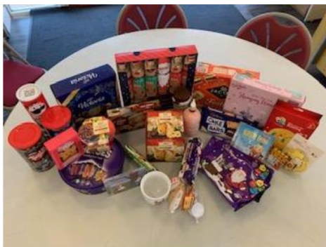
Christmas Hampers with a selection of Festive goodies donated by P.O.W families and staff ☺