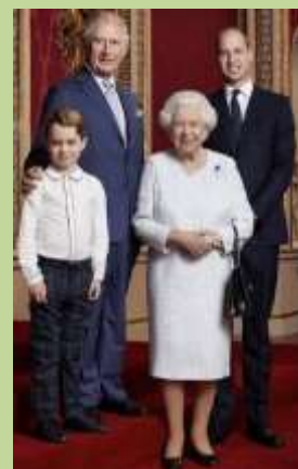
The former, current and future Prince of Wales .