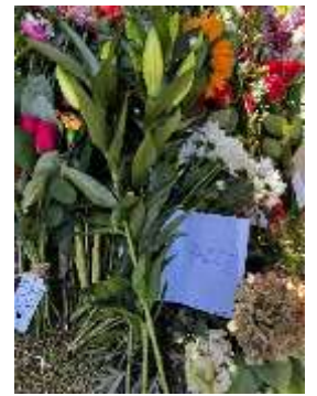
Lily in 5G laying flowers at the floral tribute in Green Park near Cianna's book bag and Chilean flag she hung up previously (see previous newsletter).