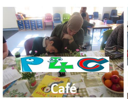
Here are some of the parent comments: