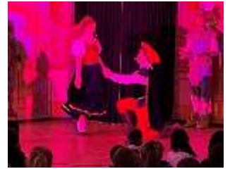
Who confessed their LOVE?