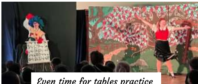
Even time for tables practice