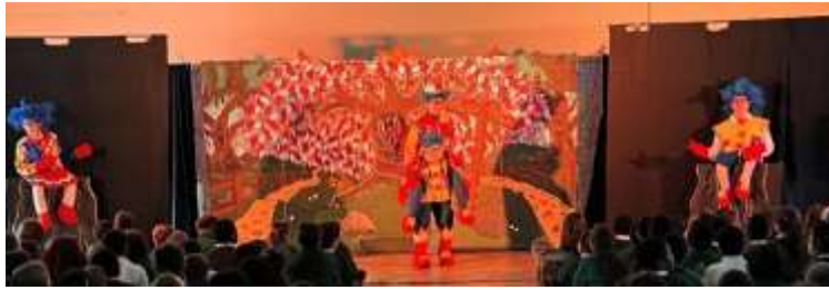
Goggle, Giggle, Google and Grrr Box