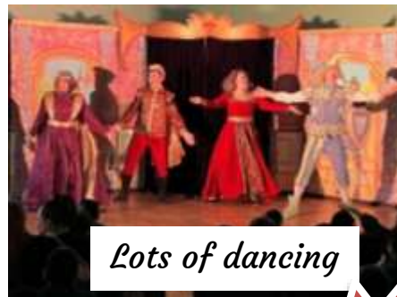
Lots of dancing