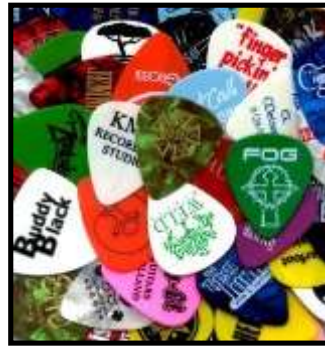
1922 Guitar pick