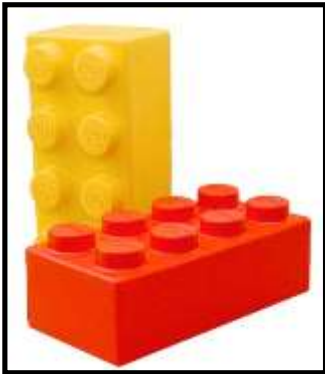
1954 Lego bricks