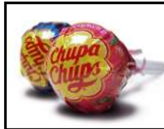
1958 Chupa Chups lollies