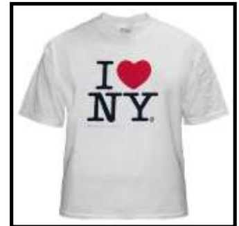
1976 I love NY t-shirt