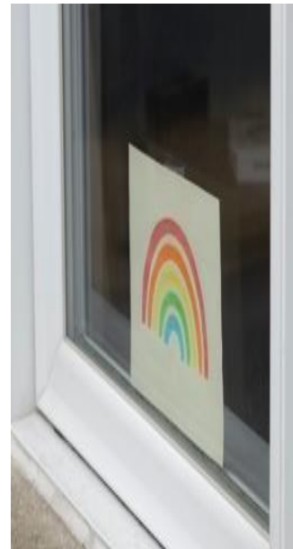
watches and waits