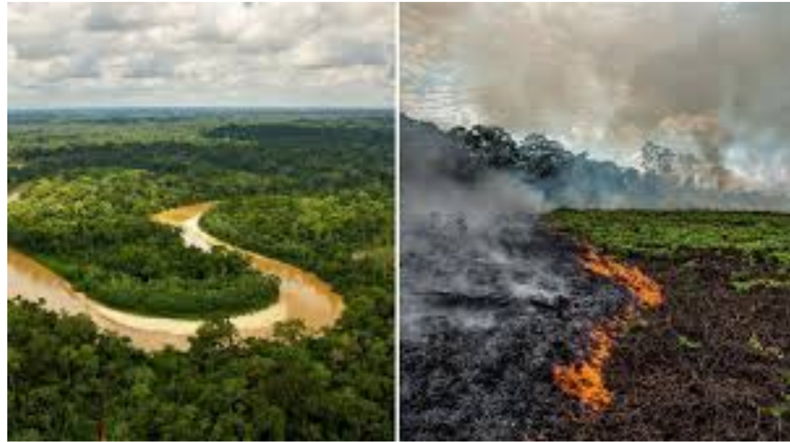
Amazon forest before and after.