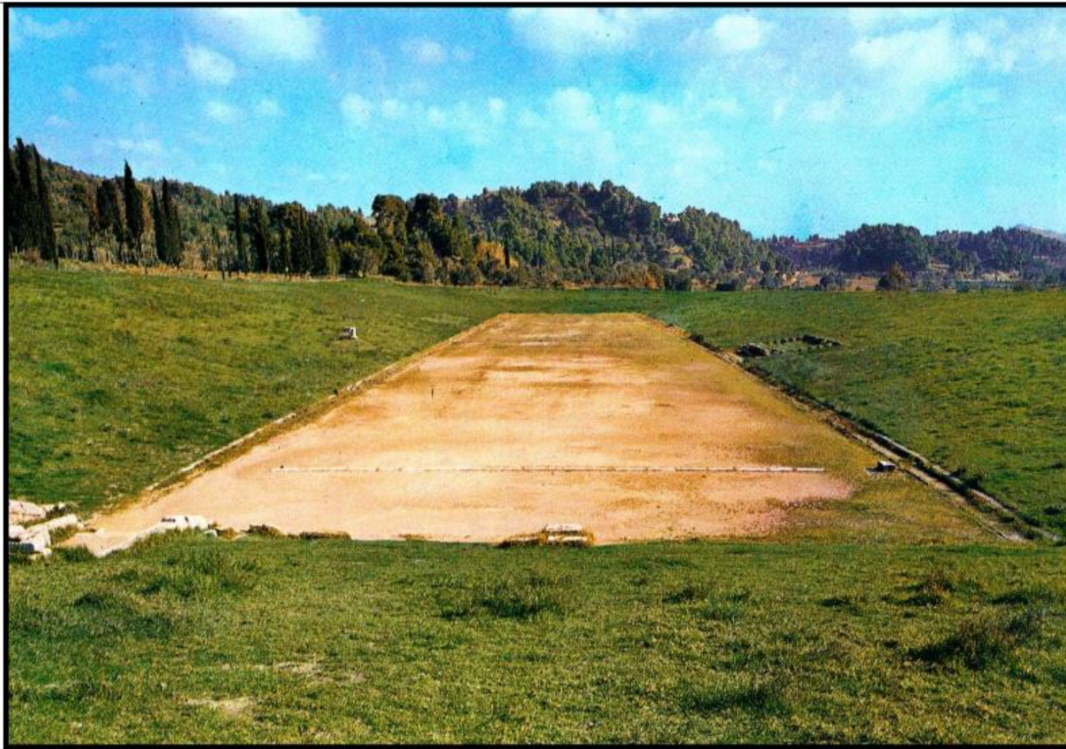
The ancient stadium at Olympia.

What do you know about the Ancient Greek Olympics?