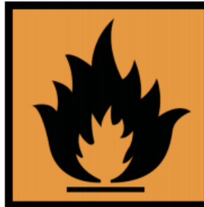
Flammable (may catch fire)