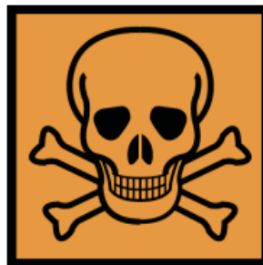
Toxic (may damage health)