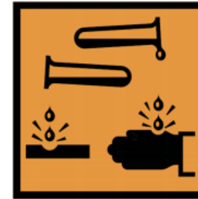
Corrosive (may damage skin)