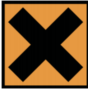
Irritant (may irritate skin)