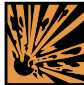
Explosive (may explode)