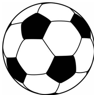
3D Shape Sphere Ball