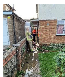
Helping local residents