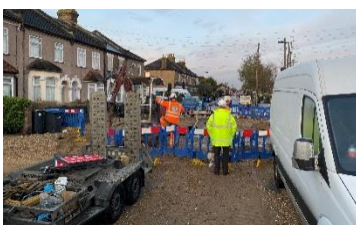
The burst water main created a huge hole and much inconvenience.