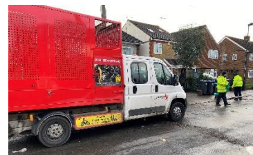
Cleaning the roads