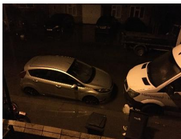
Salisbury and Ordnance Road are flooded