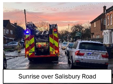
Sunrise over Salisbury Road