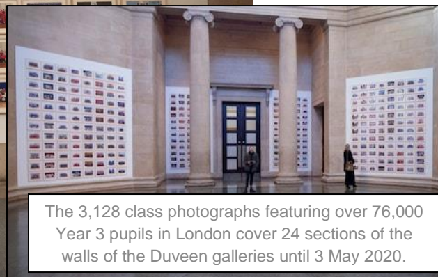
The 3,128 class photographs featuring over 76,000 Year 3 pupils in London cover 24 sections of the walls of the Duveen galleries until 3 May 2020.

Explored through the vehicle of the traditional school class photograph, this vast new art work is one of the most ambitious portraits of children ever undertaken in the UK. It offers us a glimpse of the capital's future, a hopeful portrait of a generation to come.