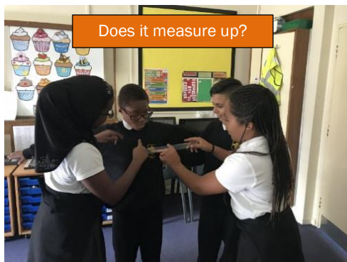
Does it measure up?