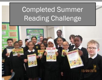
Completed Summer Reading Challenge