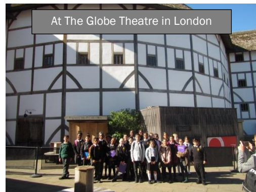
At The Globe Theatre in London