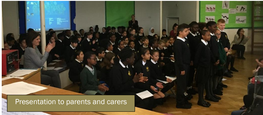
Presentation to parents and carers

Year 6 pupils have made an excellent start to the term, demonstrating our school values through their engagement, hard work and sense of responsibility. This is illustrated by these photos and the letter of commendation below.