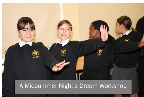
A Midsummer Night's Dream Workshop