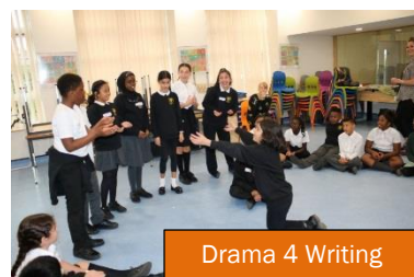
Drama 4 Writing