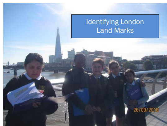
Identifying London Land Marks