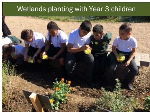
Wetlands planting with Year 3 children

Year 6 pupils have made an excellent start to the term, demonstrating our school values through their engagement, hard work and sense of responsibility. This is illustrated by these photos and the letter of commendation below.