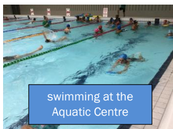
swimming at the Aquatic Centre