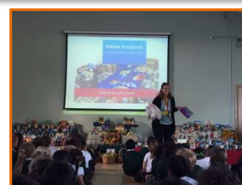
Our pupils learnt about the importance of the Enfield Food Bank.