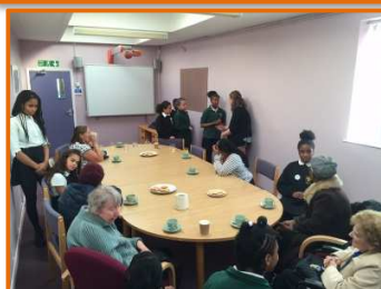
Prefects talking to our special guests.

Harvest festivals are usually held in Autumn, in September or October.