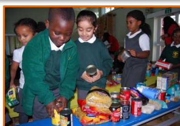
Our youngest learners from Daycare and school celebrated together.