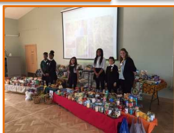
Enfield Food Bank gratefully received the food donations.