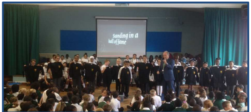
Some Y6 pupils already earned their black jumpers

SHOW US YEAR 6! WE LOOK AT YOU! LEAD THE WAY!