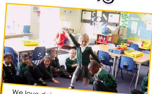
We love doing drama in 1S. This week we acted out Walter's Windy Washing Line !