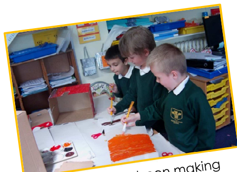
In DT we have been making houses out of cardboard boxes!