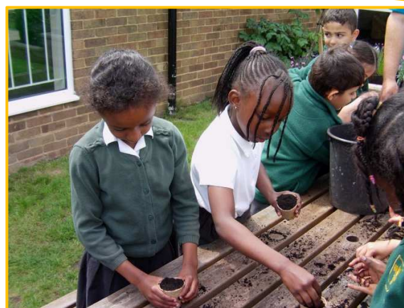
"Planting the seeds was really good fun!"