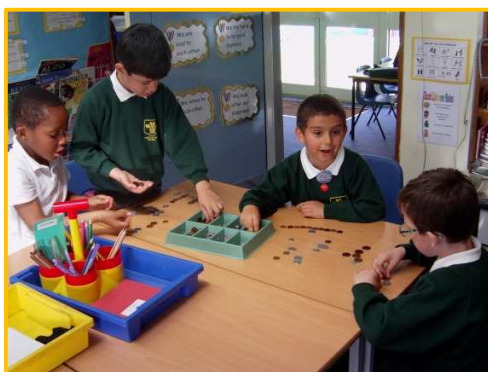
We sorted out lots of different coins ready to play our shop game.