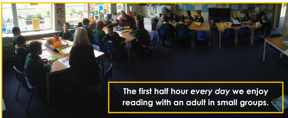
The first half hour every day we enjoy reading with an adult in small groups.