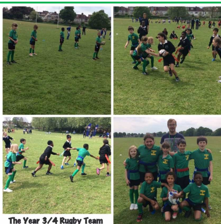
The Year 3/4 Rugby Team

The team that took part in yesterday's Tag Rugby Tournament had a great time. They learnt a lot about the game and had a good team spirit. Well done all.