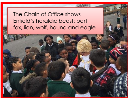
The Chain of Office shows Enfield's heraldic beast: part fox, lion, wolf, hound and eagle