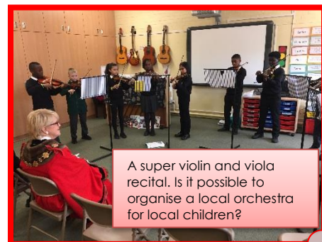
A super violin and viola recital. Is it possible to organise a local orchestra for local children?