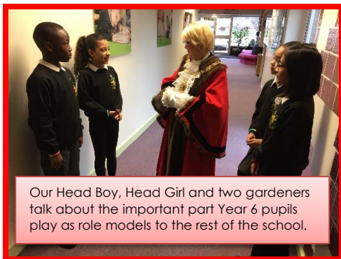
Our Head Boy, Head Girl and two gardeners talk about the important part Year 6 pupils play as role models to the rest of the school.