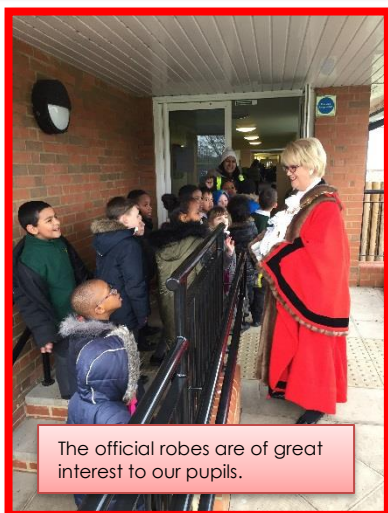
The official robes are of great interest to our pupils.