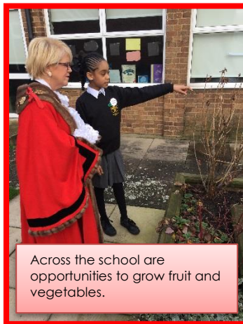
Across the school are opportunities to grow fruit and vegetables.