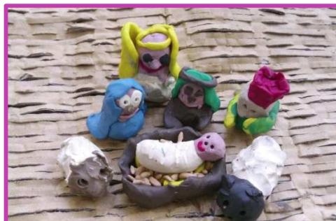
Clay nativity set created in Rainbow class as part of the Y2 performance this week.