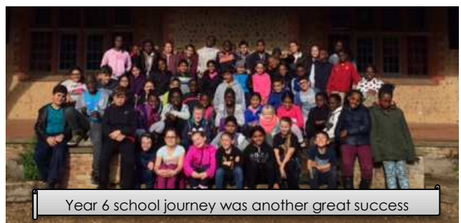
Year 6 school journey was another great success

The strike action has been cancelled pending further talks.