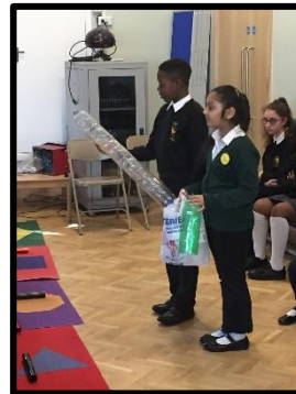
MSPs appeal for plastic bottles for our green house. The 3 classes that collect the most will get a prize.

You are invited to keep up to date with the School Parliament through our webpage on the school's website under the 'Our School' section – About our School/School and British Values/School Parliament