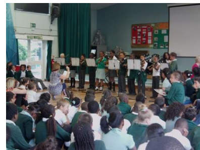
Music concert on Tuesday